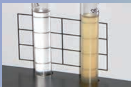
2% Pt Clear and cloudy