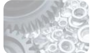
Industrial Process Manufacturing