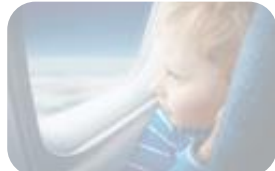
Aircraft & Aerospace